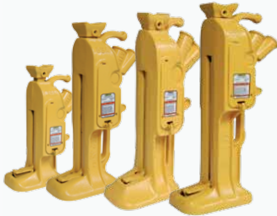
RJ84A, RJ85A, RJ1017 & RJ86A Shown

Capacity Range .....► 5 - 20 tons Stroke Range .....► 7 - 21.25 in. Maximum Toe Height Range .....► 1.62 - 2.25 in.